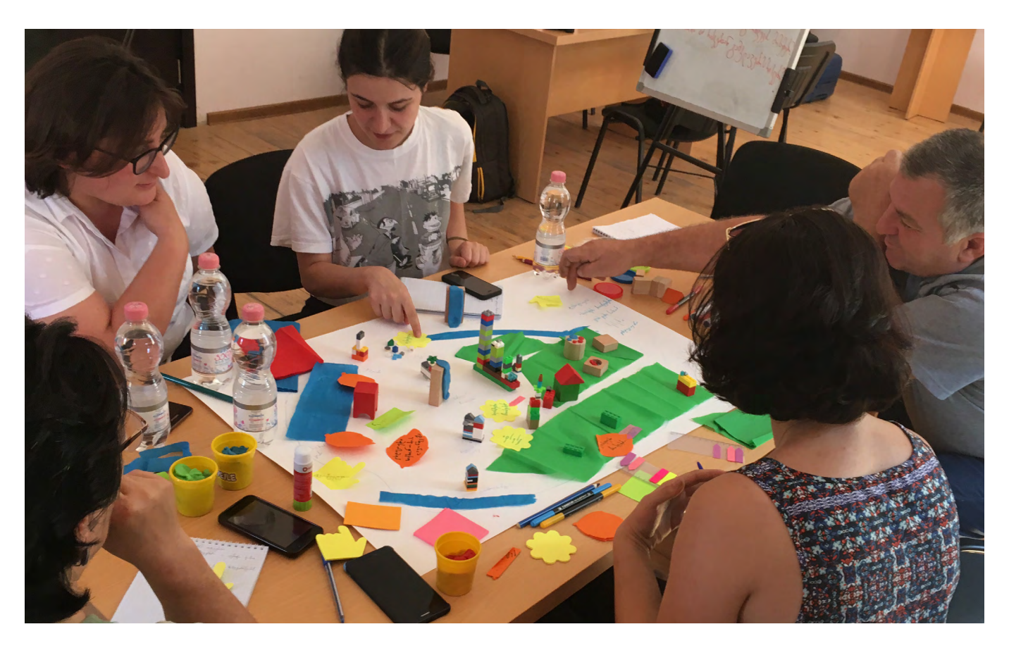
inSIGHT being played in Racha, Georgia, 2019.

Examples may include, but are not limited to: representative groups of farmers, doctors, local officials in charge of urban planning and disaster risk reduction, emergency responders, heritage professionals, teachers, artists, musicians, performers, crafts persons, etc.