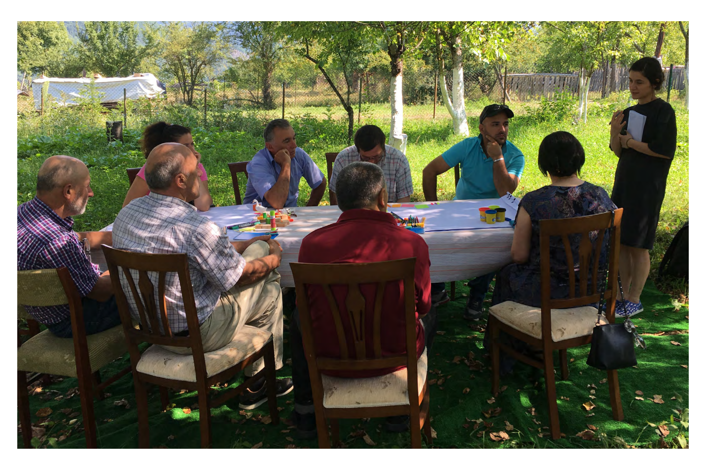
Facilitators choosing to play inSIGHT outdoors in Racha, Georgia, 2019.