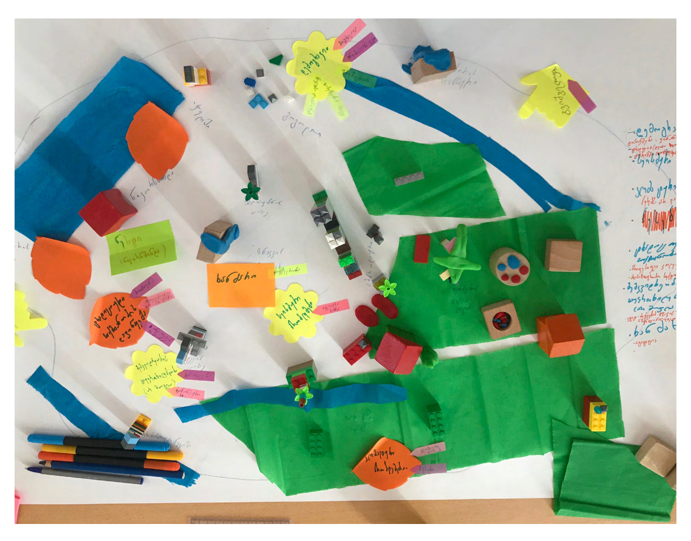
Example of the different materials that can be used to depict heritage resources and landscape features on an inSIGHT map.

After reflection, the facilitators could ask each group to list their respective insights.