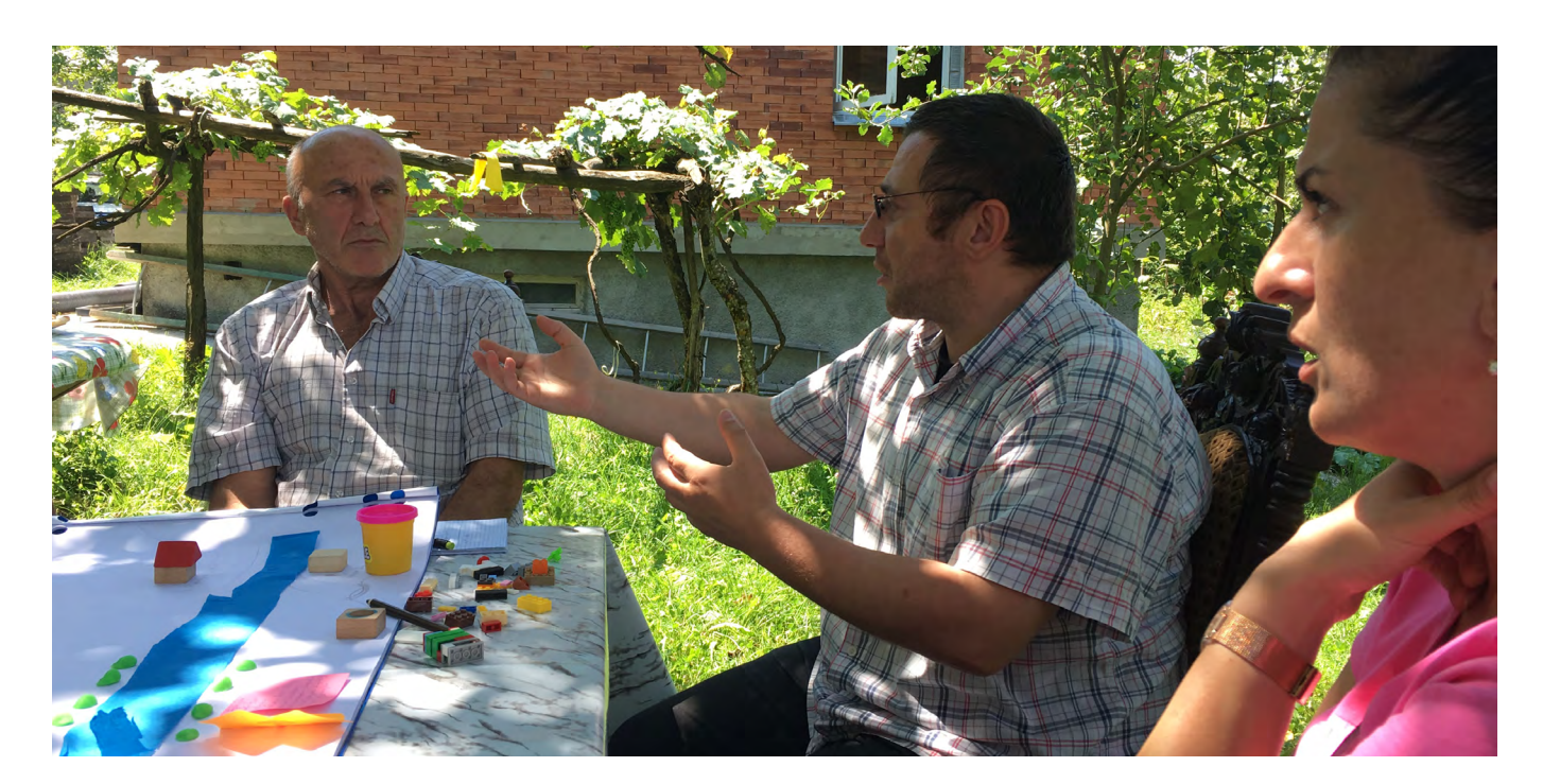
inSIGHT being played in Racha, Georgia, 2019.