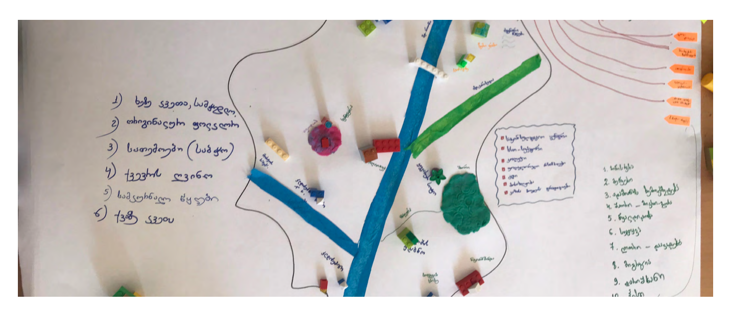
The scale of the inSIGHT map is decided by the players, it can be limited to a village, city or an entire region.

Members of the Georgian National Committee of the Blue Shield, an NGO dedicated to the protection of cultural heritage from disasters and conflicts, acted as the facilitators and note takers. Their professional backgrounds included prior experience in heritage protection and disaster risk reduction.