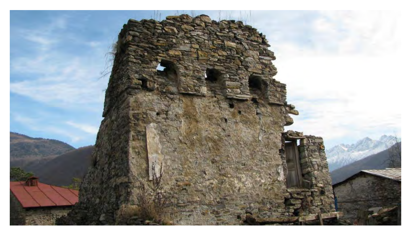
"Duroiani Sakhli", a traditional tower house in village Ghebi, Upper Racha, Gerorgia, 2019.

Actions for enhancing disaster resilience identified by the players, which will be carried forward in collaboration with the relevant local agencies included: better access to mobile, internet and digital services, as well as apps for off-line access in situations of emergency; government supported training programmes for the development of handicrafts; support for attracting tourism in the form of homestays or experiential tourism; and more investment in community-based risk mitigation and preparedness.