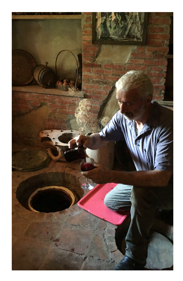
Winemaking is one of the most significant intangible heritage of Racha, Georgia, 2019.

How locals define and value heritage does not necessarily match with the classification employed by the national heritage authorities. Example: several participants in the Discovery stage identified a library and a community centre as significant heritage as opposed to the other officially listed heritage in the region.