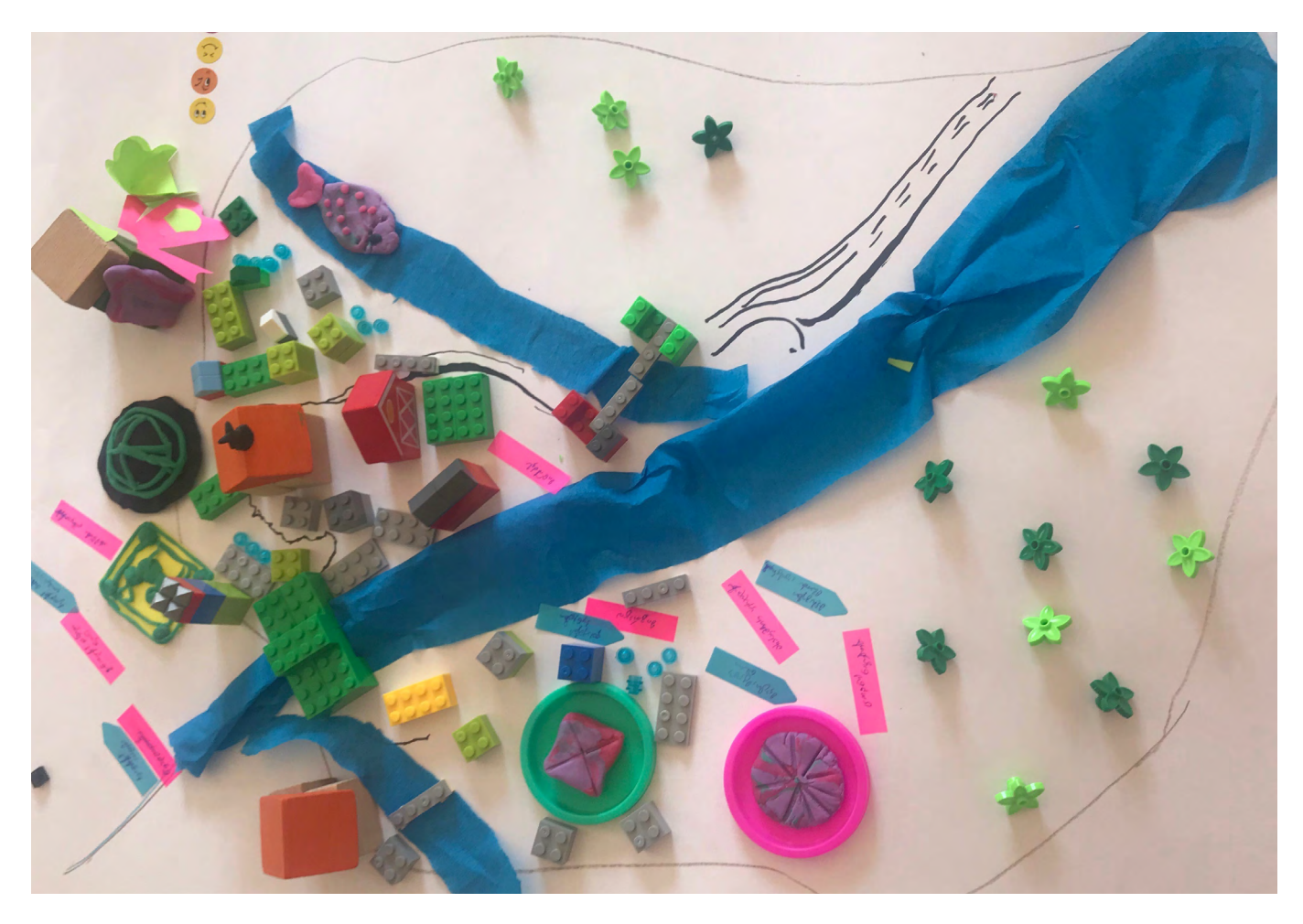
Example of an inSIGHT map created by different community members in Racha, Georgia, 2019.

The overall aim is to provide a creative tool for encouraging a people-centred approach to disaster risk reduction, which integrates concerns for cultural and natural heritage.